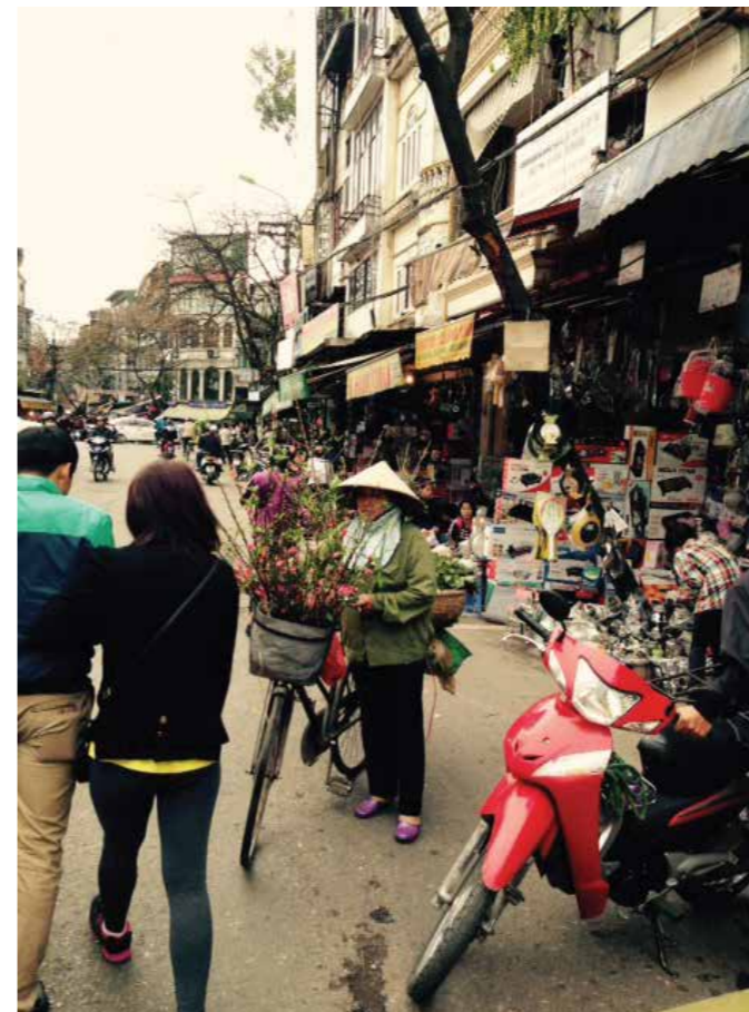
Hanoi street scene

In a country where all books and art shows still have to be approved by the party and its propaganda ministry, it is not easy to get heard while subject to censorship. But younger poets and writers are challenging the party and its doctrine, and pushing forward into dissident territory.